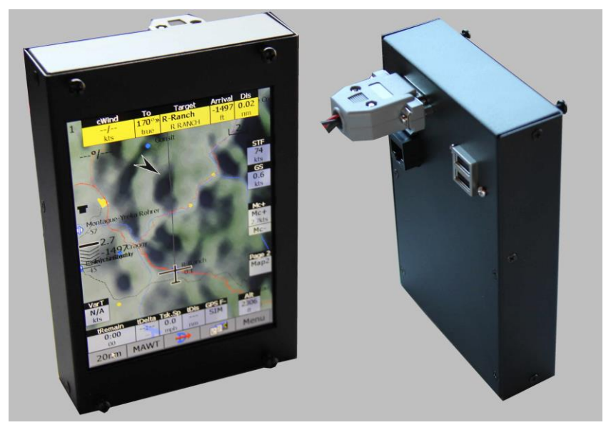
Craggy Aero Ultimate Le 5.7®

Craggy Aero, LLC 3901 River Court Hornbrook, CA 96044 USA